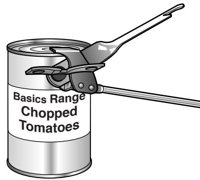
can with traditional opening method