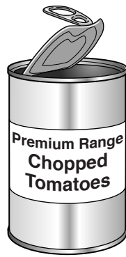
can with modern opening method

3 Fig. 4 shows two ways of opening cans.