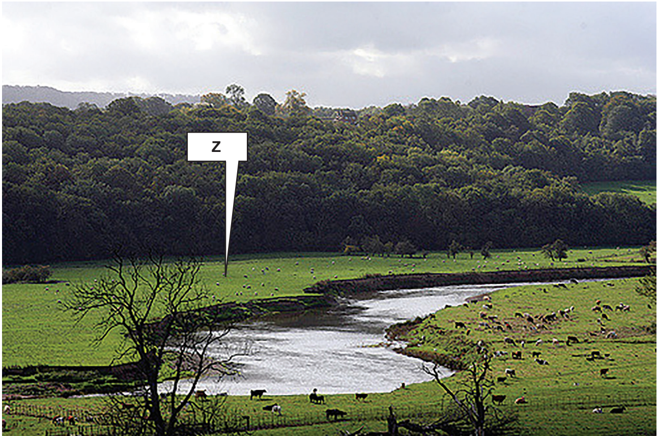
Fig. 2 – Photograph of the River Severn