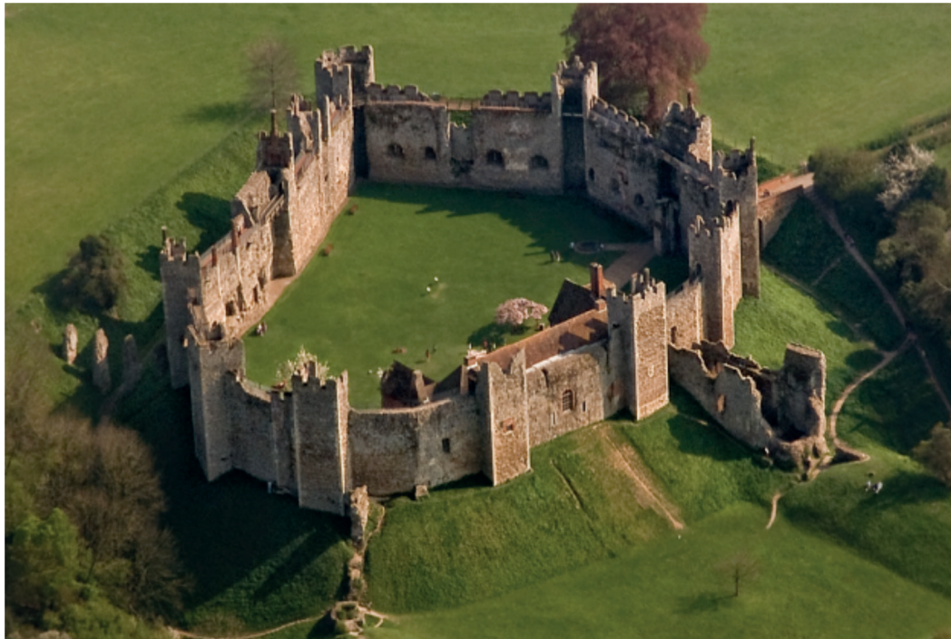
An aerial photograph of the remains of Framlingham Castle.

An extract from an official document called the Close Rolls, in 1310. The Close Rolls was a list of orders issued by the King.