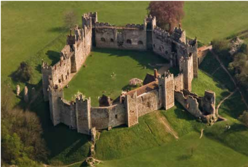
An aerial photograph of the remains of Framlingham Castle.

An extract from an official document called the Close Rolls, in 1310. The Close Rolls was a list of orders issued by the King.