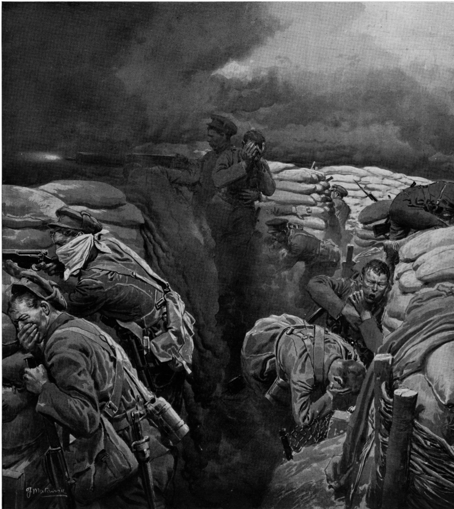
How the German Gas Devil Comes – Thick Green Mist Rolling Towards The Trench

A picture published in a British newspaper in May 1915 showing a gas attack. This was the first time gas was used in the war. Underneath the picture it says, ‘How the German Gas Devil Comes – Thick Green Mist Rolling Towards The Trench’. The picture shows British soldiers affected by clouds of smoke coming over their trench. One soldier has tied a handkerchief over his nose and mouth and is standing with his rifle ready to fire. Other soldiers are in pain and have put their hands over their mouths and eyes. One man is coughing, while another has bent forward with his hands to his face.