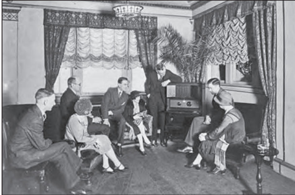
[A photograph of a group of Americans listening to the radio in the late 1920s]

Study the photograph below and then answer the questions which follow.