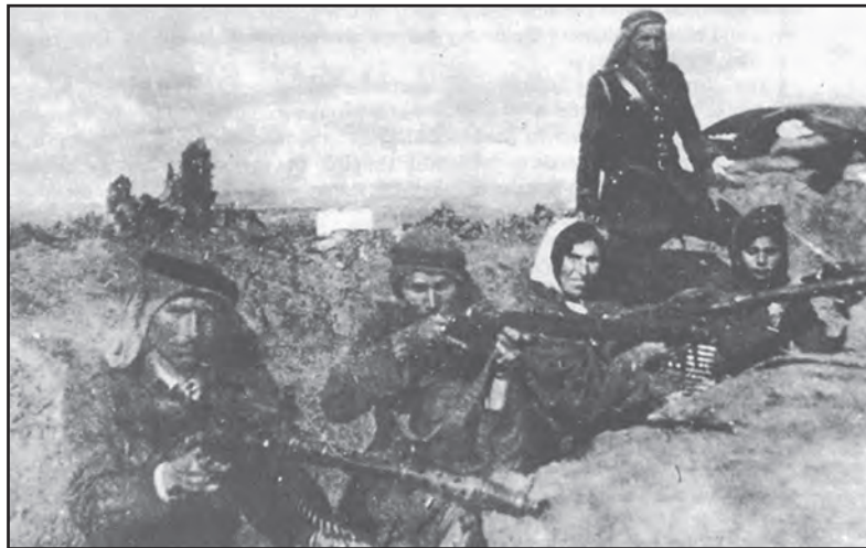
[A picture of the Arab Revolt in the late 1930s]