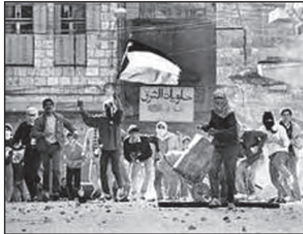
[A photograph of the Palestinian uprising on the West Bank in 1987]