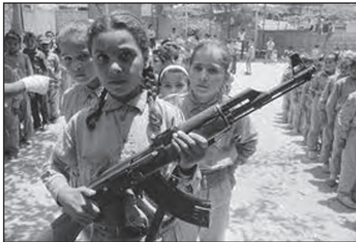
[A photograph of a PLO training camp in the late 1960s]