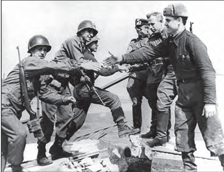
[A photograph of American and Russian soldiers greeting each other in Germany in May 1945]