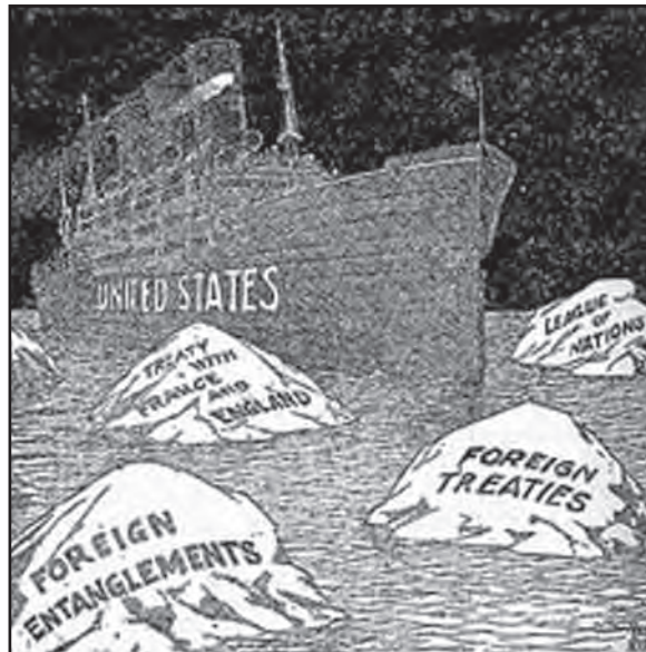
[A cartoon of 1930 showing the dangers of the USA getting involved in world affairs]

(a) What does Source A show you about American foreign policy in the early 1930s? [2]