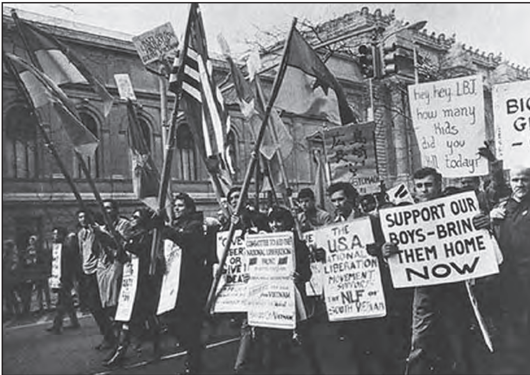
[A photograph of student protesters in the USA in 1969]