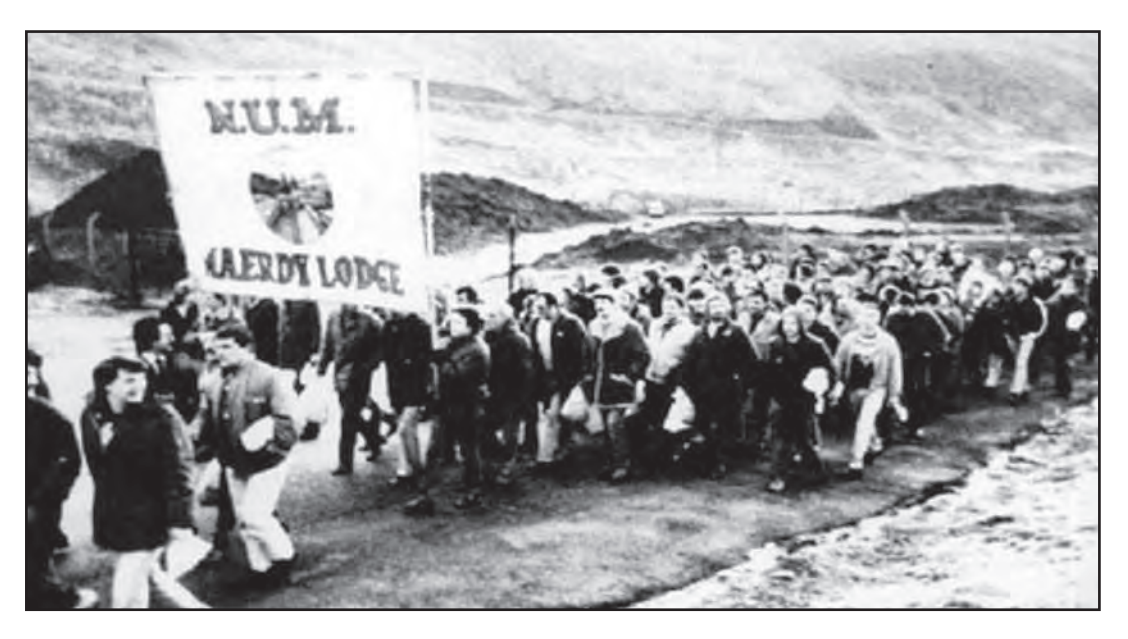
[Miners from Maerdy Colliery returning to work after the Miners' Strike in 1985. The colliery closed a few years later.]