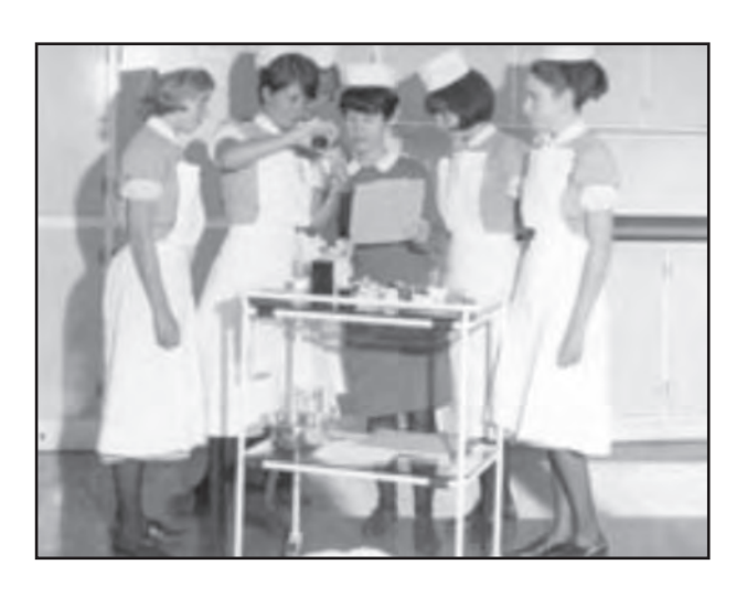
[Trainee nurses in the new National Health Service established in 1948]