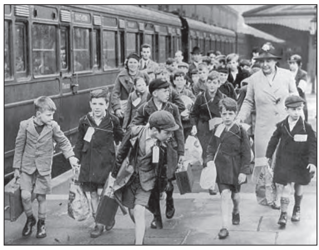
[Evacuees from London arriving in South Wales in September 1939]