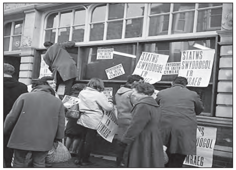
[Members of Cymdeithas yr Iaith Gymraeg (Welsh Language Society) protesting for official status for the Welsh language in 1963]