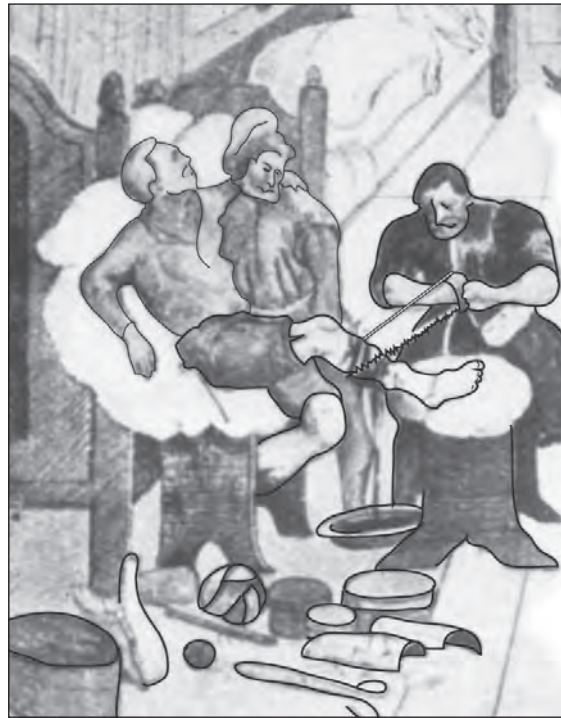
[A medieval barber surgeon amputating a patient's leg]

(a) What does Source A show you about barber surgeons?