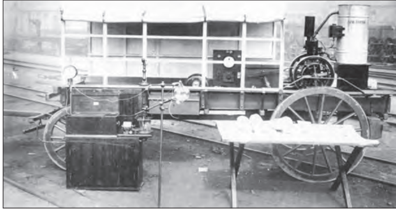
[A portable X-ray machine in the early twentieth century. This allowed doctors to see inside the body without surgery]