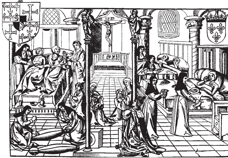
[Nuns attending patients in a medieval hospital]

(a) What does Source A show you about medieval hospitals?