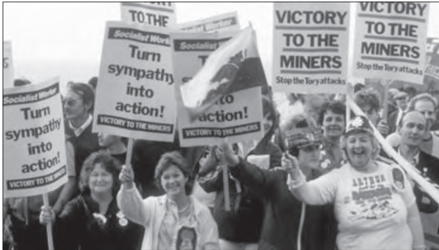
[A protest march during the Miners' Strike, 1984-1985]