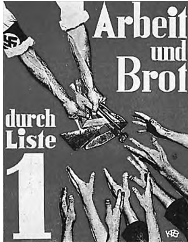
[A Nazi election poster from 1932. The caption reads 'Work and Bread']