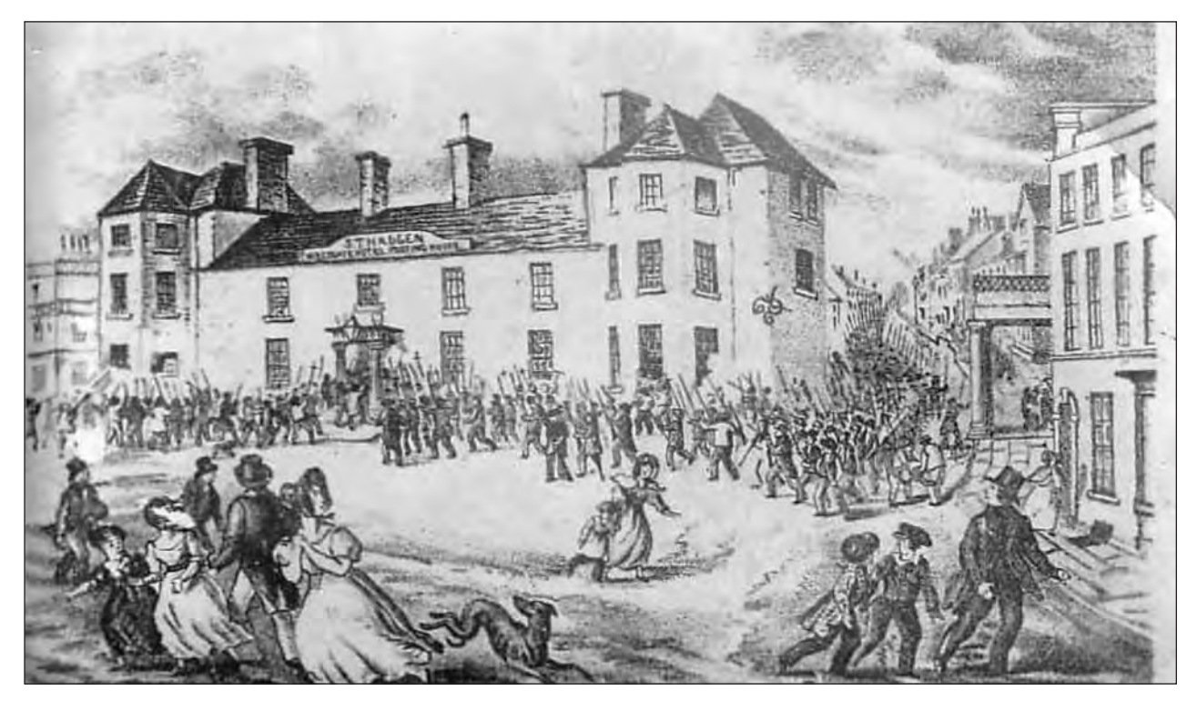
[An illustration showing the Chartist march on Newport, November 1839. This was published in a middle class newspaper shortly after the event took place]