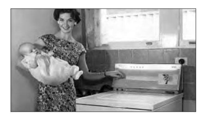
[A photograph of a young American woman in the 1950s]