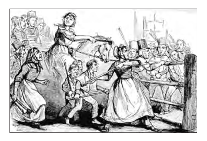
[An illustration of the Rebecca Rioters attacking a toll gate]