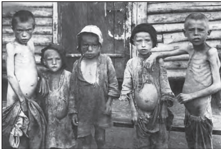
[A photograph of a group of starving Russian children towards the end of the Civil War in 1921]