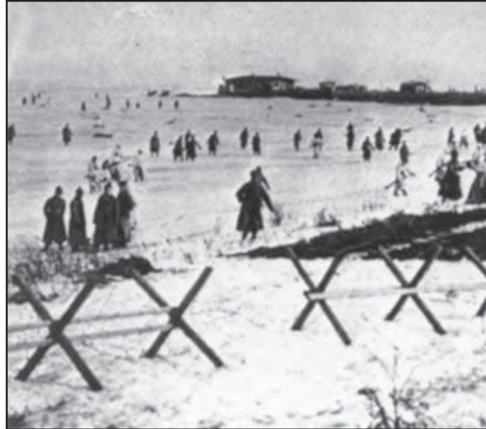
[A photograph of Red Army soldiers crossing the ice to attack the sailors on Kronstadt island on 17 March 1921]

Study the photograph below and then answer the questions which follow.