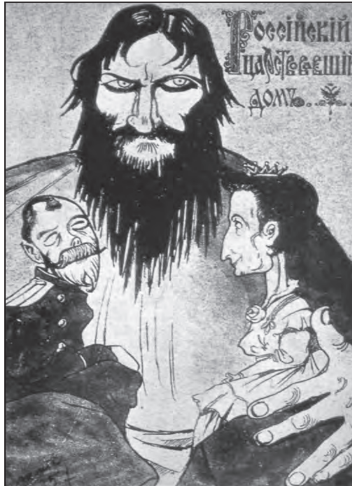
[A Russian cartoon of 1916 showing Rasputin with the Tsar and Tsarina]

Study the picture below and then answer the questions which follow.