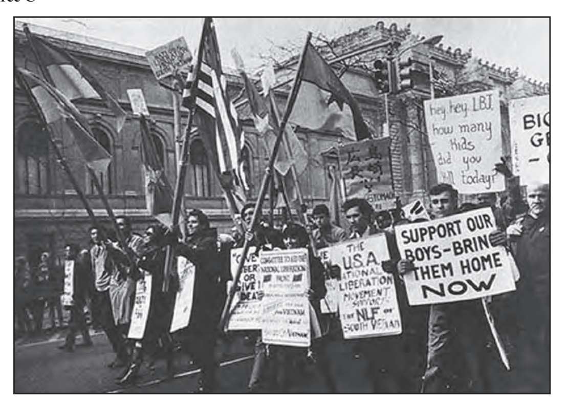
[A photograph of student protesters in the USA in 1969]