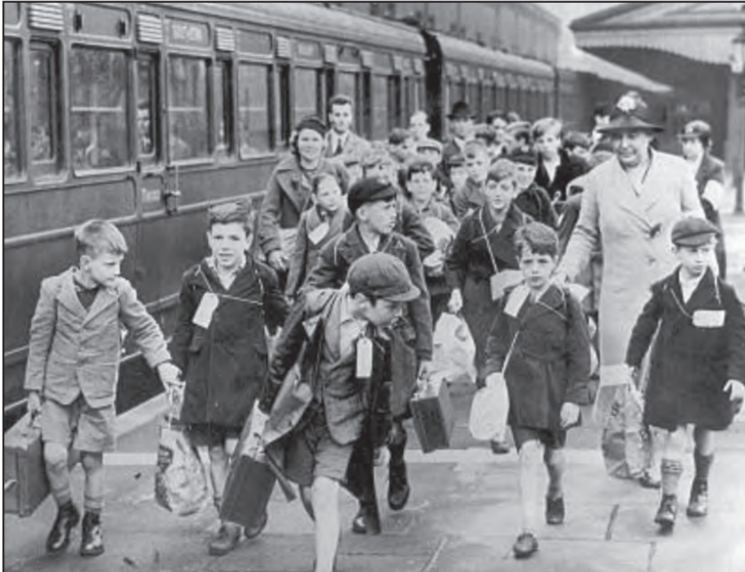
[Evacuees from London arriving in South Wales in September 1939]

(a) What does Source A show you about evacuation?