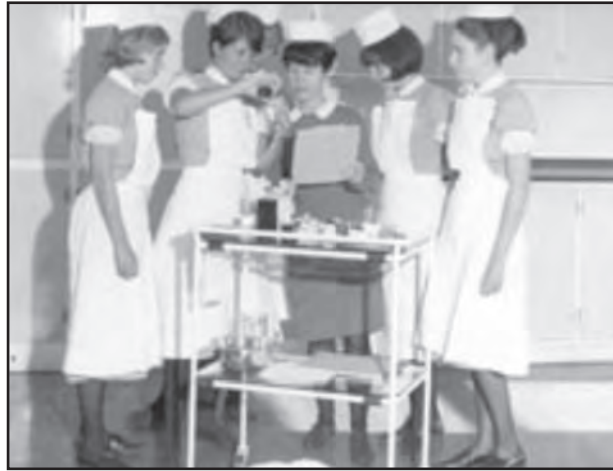
[Trainee nurses in the new National Health Service established in 1948]

(a) What does Source A tell you about job opportunities for women in Wales after the Second World War? [2]