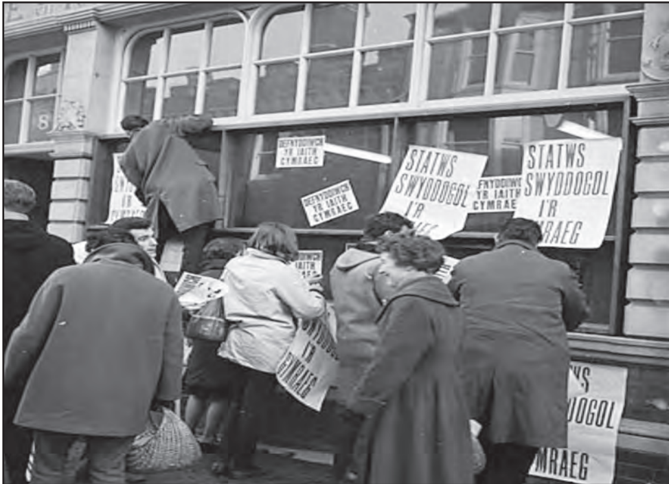
[Members of Cymdeithas yr Iaith Gymraeg (Welsh Language Society) protesting for official status for the Welsh language in 1963]