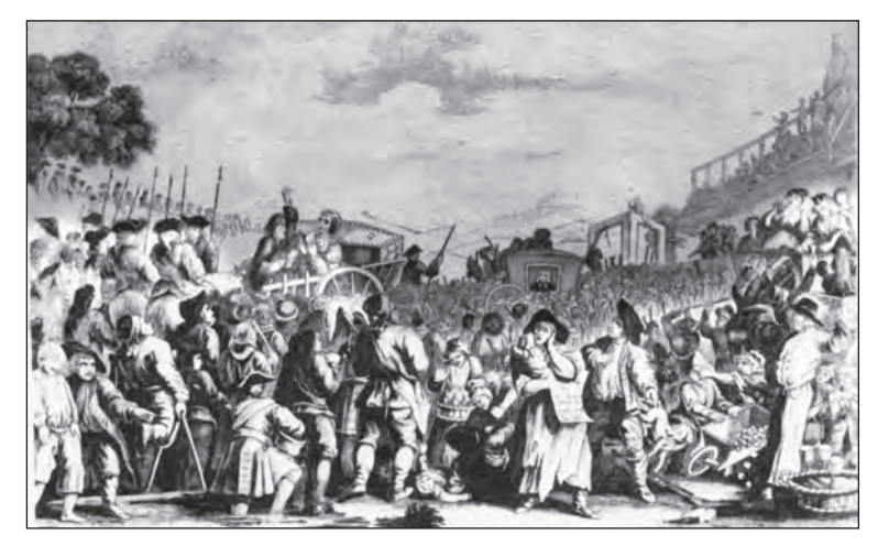
[A huge crowd gathered to watch a public execution at Tyburn in 1747]