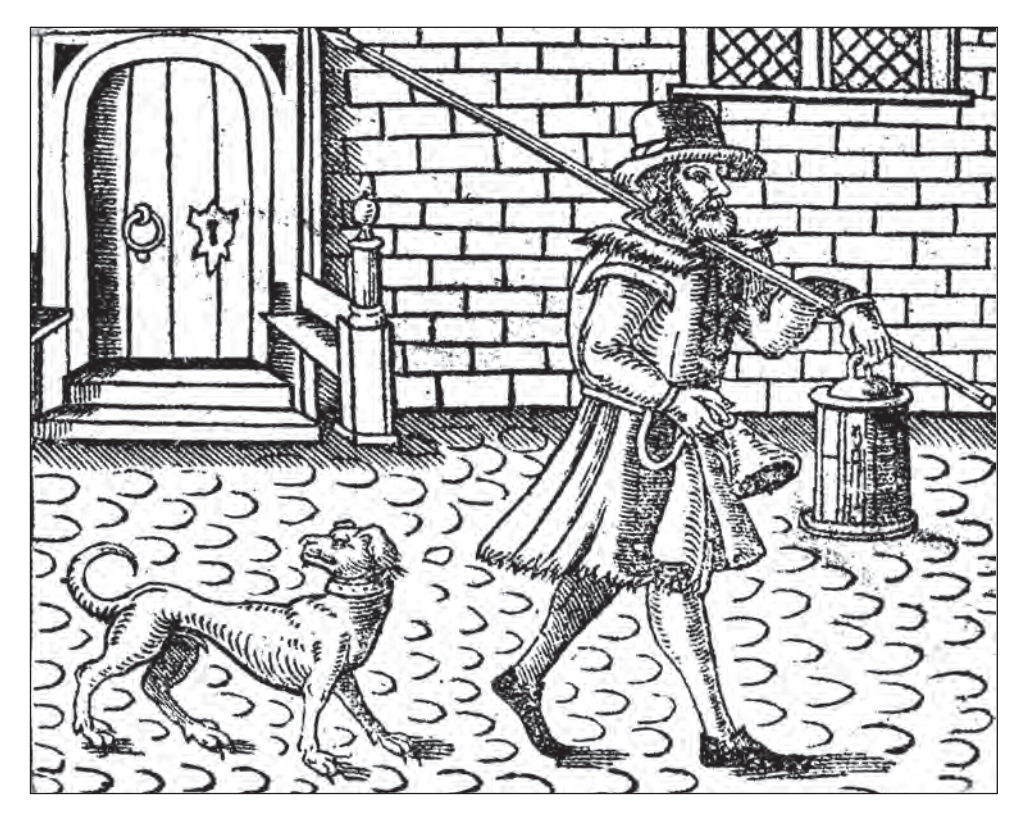
[A Tudor watchman on patrol at night]