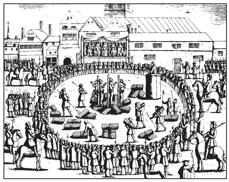
[Heretics being burned to death in London in the 1550s]