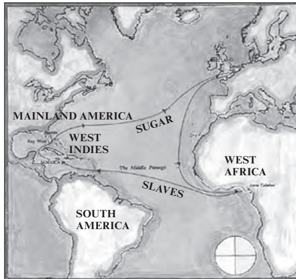
[A map showing John Hawkins's voyage of 1562, highlighting the route taken by his slave ships]

(b) Use the information in Source B and your own knowledge to explain why Sir John Hawkins established the slave trade. [4]