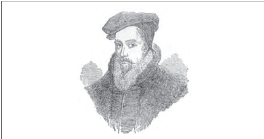
[The illustration shows William Cecil (Lord Burleigh), an important Elizabethan courtier and politician]

Study the source below and answer the questions which follow.