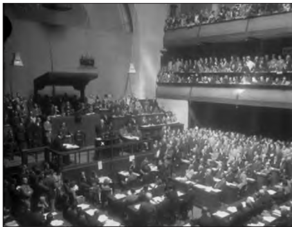
[A photograph showing Germany joining the League of Nations in 1926]