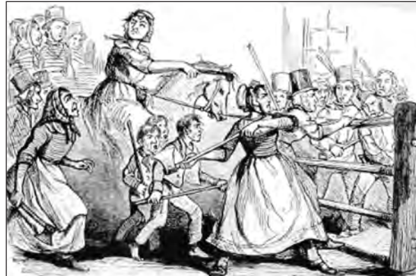
[An illustration of the Rebecca Rioters attacking a toll gate]